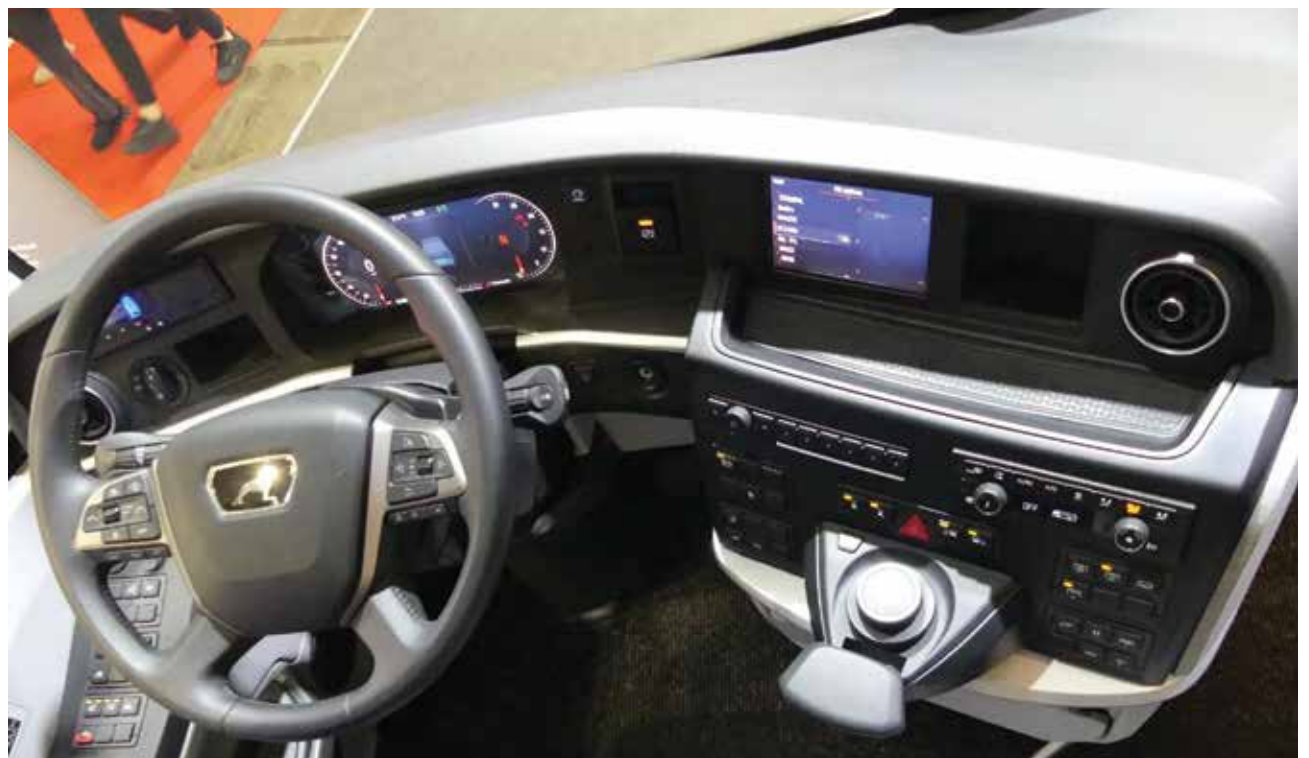
The new driver's cockpit in the new Neoplan Tourliner.

The second world premiere is the three-axle MAN Lion's Intercity LE 14, which completes the successful range of low-entry buses. With its length of 14.43 metres, the Lion's Intercity LE 14 is one of the shortest three-axle vehicles. Nevertheless, it has space for up to 127 passengers, of which a maximum of 63 can be seated. Thanks to its steered tag axle, this Intercity bus has a compact turning circle of 23.8 metres. Optionally, the bus is available with a third door at the rear; this variant will be on display at Busworld. ■