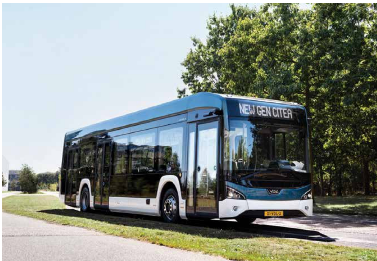
The new generation Citea.

Furthermore, the new generation Citea for KVG feature a mirror replacement system with cameras instead of mirrors. From July next year until 2025, 50 new electric buses will be delivered to Kiel. The city of Kiel is a 100 percent shareholder in KVG, Kieler Verkehrsgesellschaft mbH. ■