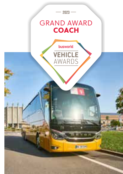
SETRA S 516 HDH HALL 5 | BOOTH 503

As always, the best performances in the different sub categories are awarded with a best of category label.