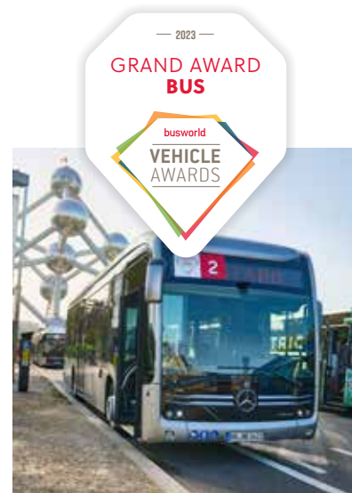
MERCEDES-BENZ E-CITARO HALL 5 | BOOTH 503