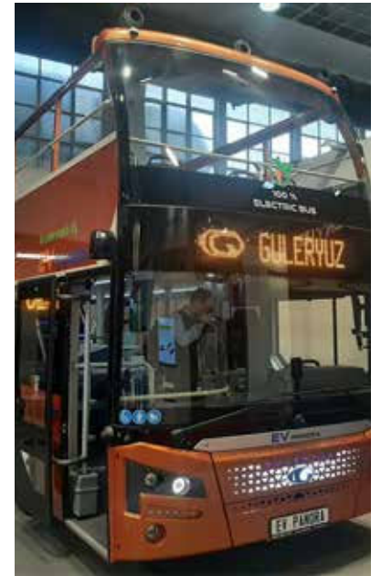
The 11-metre EV Panora open bus.

Aftersales service has not been neglected. Güeryüz Bus Europa GmbH in Wuppertal, Germany, helps provide fast spare parts supply all over Europe. ■